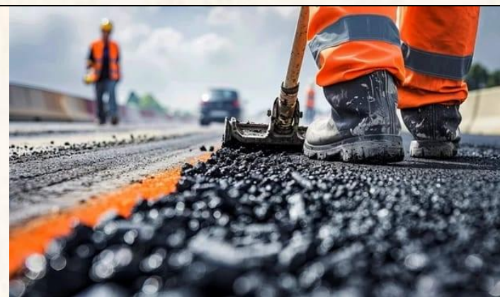
'Zulu, ME, (1999), Project ASIPHEPHE - Implementation [Paper 9], South African Transport Conference, 19-22 July 1999, CSIR Conference Centre, South Africa, Session 2B: Traffic Management and Safety'.